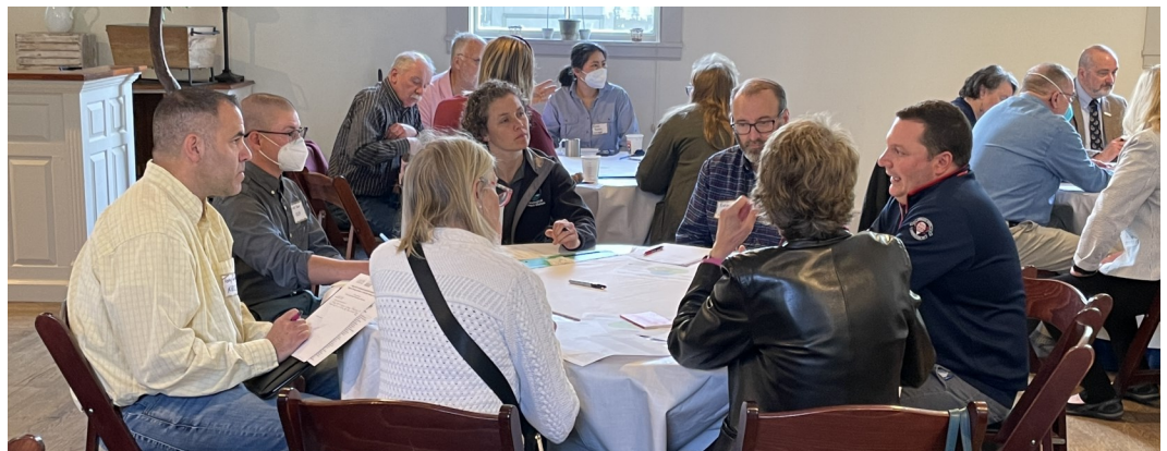
Environmental stakeholders discuss important public messaging to alert the public to HABs when they occur.

Otsego 2000 provided a $5,000 donation to the Biological Field Station from the Henry S.F. Cooper Jr. Fund for Environmental Stewardship toward enhancing timely HABs data collection on Otsego Lake, an important economic driver for Otsego County.